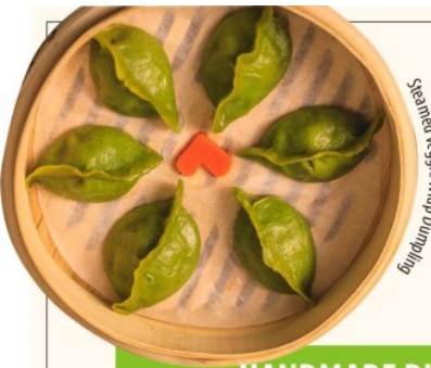
Steamed Veggie Wrap Dumpling